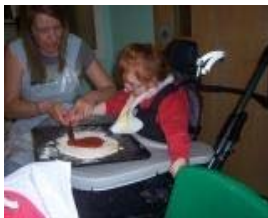
Holly helps to make pizza