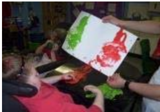
Lucy's Italian flag