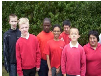
Hazel are very proud to be back.