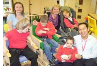
Daffodils are very glad to be back!