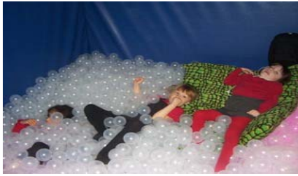
Daisies class enjoying our new soft play room