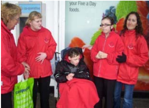
Chestnuts group visit the local shops

Please remember that school is closed on Friday November 20 th for pupils in Post 16 and Caterpillars morning and afternoon groups only. On Monday November 30 th the school is closed for all pupils for staff