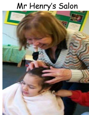
Mr Henry's Salon