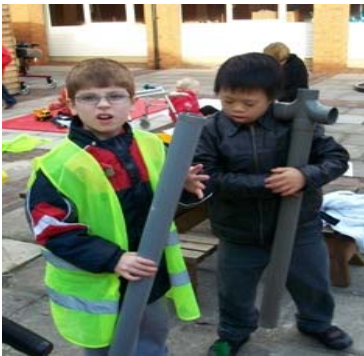
Bob the Builder Day

This week has been careers week in school where we have been focussing on the jobs that people do, and as you can see from the photographs we have had lots of fun!