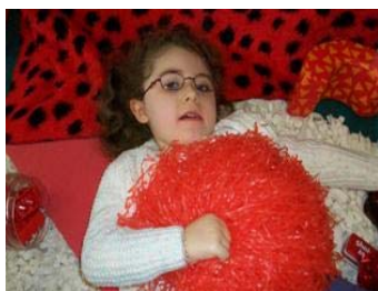
Here she is relaxing in the red area.

Caterpillars morning group have been enjoying a mini topic on Colours since half term. Each week, we have had a focus on a particular colour, or pair of colours. Each day, we have had a colour area set out with a variety of fabrics and materials for the children to explore, as well as a range of other activities planned to emphasise the colour of the week. We have had lots of fun with paints and play dough, shaving foam and custard powder. Our two little girls like to get stuck in and make a mess!