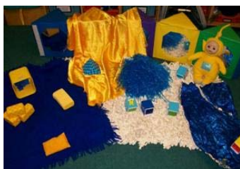
The blue and yellow class area which the girls enjoyed exploring and making a mess!