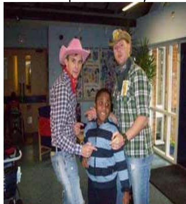
A couple of cowboys!