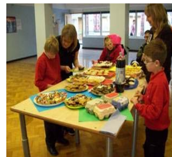
Too many cakes from which to choose!