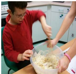
Buttercups class made their own gingerbread men decorated them and helped to sell them at the tuck shop.

As you can see from the photographs in this week's letter we all had a fun day last Thursday raising money for Children in Need. Our grand total so far is £260 which is fantastic. Thank you all for your support with this.