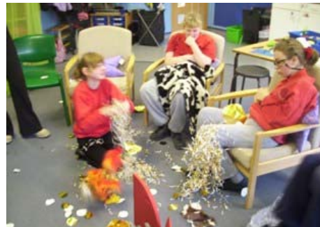
At the end of the story Jack found all the gold and he lived happily ever after.