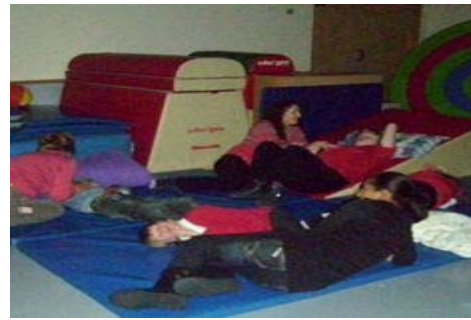
After all our hard work on the trampoline it is very important to be able to stretch out and relax

Chestnuts have been looking at Roald Dahl's revolting rhymes this half term in literacy, they are very funny! We have approached them as sensory stories and dressed up and explored props and materials. Our favourite so far has been Jack and the Beanstalk