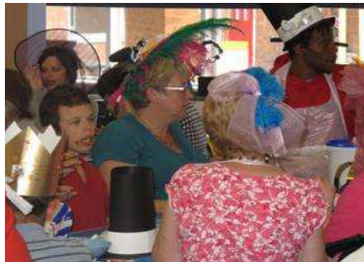
Everyone made hats for the party

As you can see from the photographs we all really enjoyed our street party in honour of the Royal Wedding - it was just as fabulous and enjoyable as the wedding itself.