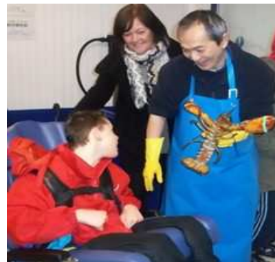
On a visit to the Chinese supermarket Paul was amused by the live lobster!

Next week is our Creative Arts Week and we are using this as an opportunity to review our Creative Arts Curriculum . Once again we are looking forward to a visit from the very popular drummers.